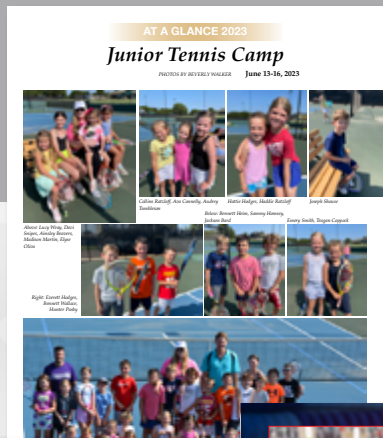
AT A GLANCE 2023 Junior Tennis Camp June 13-16, 2023