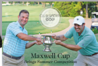
Maxwell Cup Brings Summer Competition