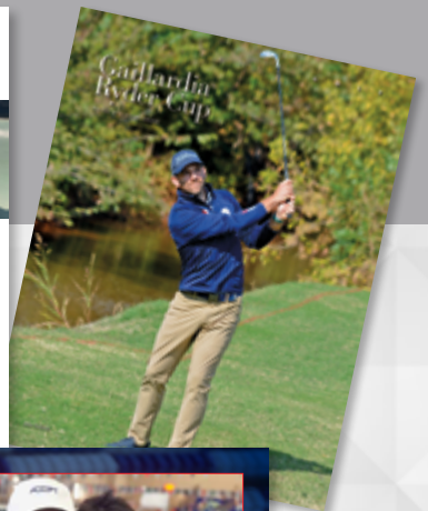
Cardinal Water Cup