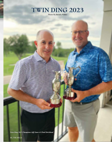
TWIN DING 2023