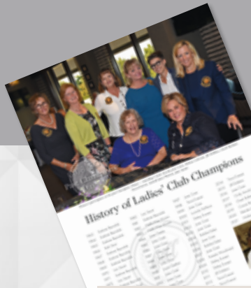
History of Ladies' Club Champions