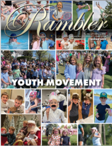
OKC Golf & CC